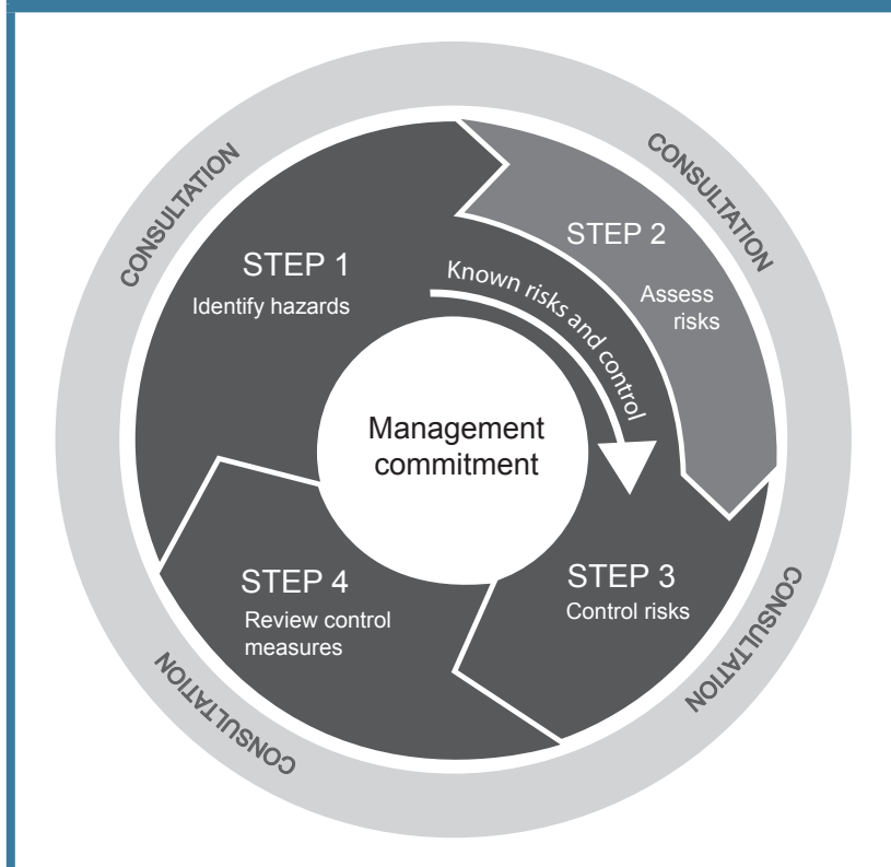
FIGURE 1: The risk management process

Many hazards and their associated risks are well known and have well established and accepted control measures. In these situations, the second step to formally assess the risk is unnecessary. If, after identifying a hazard, you already know the risk and how to control it effectively, you may simply implement the controls.