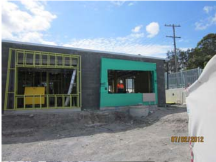
51411 - Logan 25 Bed ACU